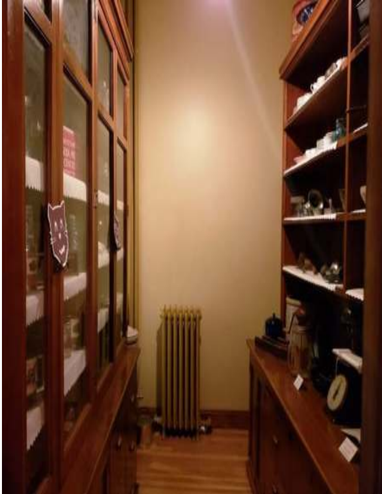
This is the Cook's Pantry.

I will also be able to see inside the Cook's Pantry and the Butler's Pantry , but I should not touch anything in here.