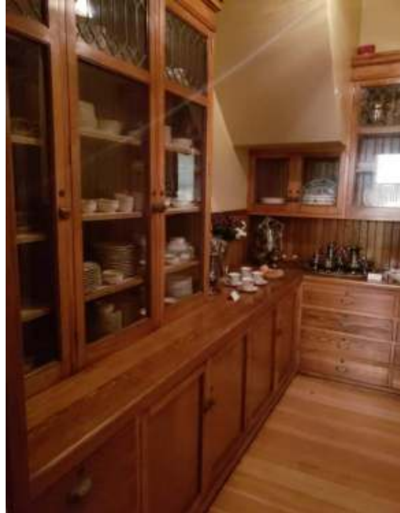
This is the Butler's Pantry.

Once I am done looking, I will follow the guide to the Back Porch.