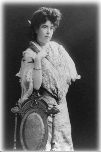
Margaret's campaign photo from a run for local public office

Margaret was urged by prominent leaders of the suffrage movement to run for U.S. Senate in 1914. Never before in history had a woman entered the United States Senate. Suffragists used color to advocate their cause. Yellow, purple and white were the official colors of the suffragist movement. These colors symbolized justice and purity of purpose and courage.