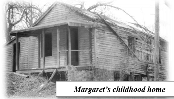
Margaret's childhood home

Together we will explore the inspirational life of a notable activist and humanitarian. You may know her as “Molly” Brown. We hope that you are inspired by Margaret Tobin Brown’s story and lasting legacy .