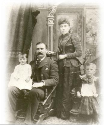
Leadville family photo

Think about what the houses we live in today might say to future generations.