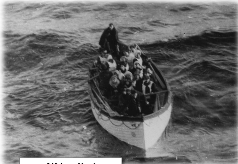
Lifeboat No. 6

She was eventually placed in Lifeboat No. 6 as it was lowered into the cold ocean. She and 23 other people spent the night in a lifeboat meant for 65, rowing to keep warm. Early the next morning the only ship to respond to Titanic's distress calls was the Carpathia , which arrived around 5:00 am and rescued the 705 survivors out of the 2,200 total on board.