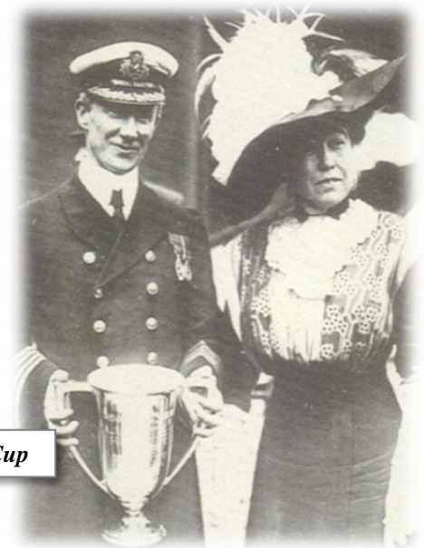
Presentation of the Loving Cup